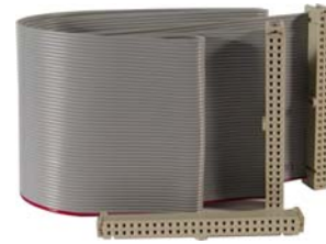
TA106: ribbon cable with 50 pin ribbon cable connectors

A 2 pin terminal block on the transition module can be used to provide +5V to each of the eight DB25 connectors (pin 9) and to supply the on board termination for RS422/RS485. Support of the +5V is selectable by jumper for each serial channel. The +5V is fuse protected by a 1A multi-fuse.