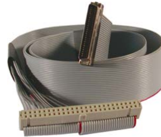
TA105: ribbon cable with 50 pin ribbon cable connector and 50 pin SCSI-2 male connector

TxD+/-, RxD+/-, GND are supported for the TPMC866-11x/12x (RS422) and Dx+/-, GND for the TPMC866-12x (RS485).