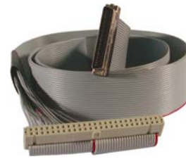
TA105: ribbon cable with 50 pin ribbon cable connector and 50 pin SCSI-2 male connector

A 2 pin terminal block on the transition module can be used to provide +5V to each of the eight DB25 connectors (pin 9) and to supply the on board termination for RS422/RS485. Support of the +5V is selectable by jumper for each serial channel. The +5V is fuse protected by a 1A multi-fuse.